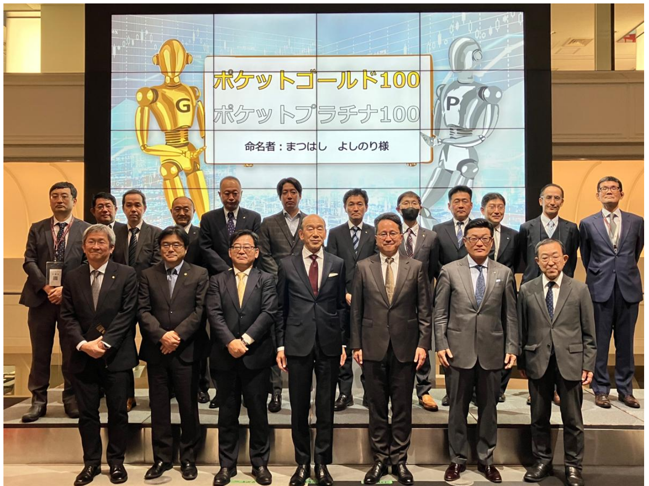
Nickname Announcement Ceremony for New Gold and Platinum Futures

On October 9, 2025, the price of Gold Standard Futures on OSE broke into the JPY 20,000 range, and on September 26, Platinum Standard Futures exceeded JPY 7,000. Reflecting this upward trend in precious metal prices, trading activity has been remarkably robust, with the current average daily volume reaching 98,794 contracts for Gold Standard Futures and 13,755 contracts for Platinum Standard Futures.