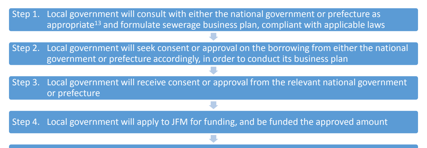
Figure 2: Process for Project Funding<sup>13</sup>

Following the extension of loans by JFM to the Eligible Projects, JFM's Green Bond Working Group will conduct surveys with the relevant local governments to gain impact metrics. The net proceeds (or an amount equal to the net proceeds) of the issuance of the Green Bonds will only be allocated to Eligible Projects, and a portfolio (the Effective Portfolio) will then be selected from the Eligible Projects based on projects run by local governments which return effective responses to a follow-up survey.